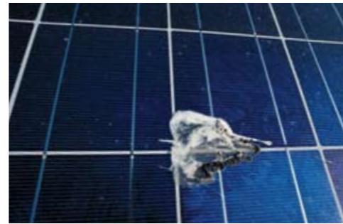
The solar module soiled by bird droppings

After cleaning the concerned modules the system runs perfectly again.